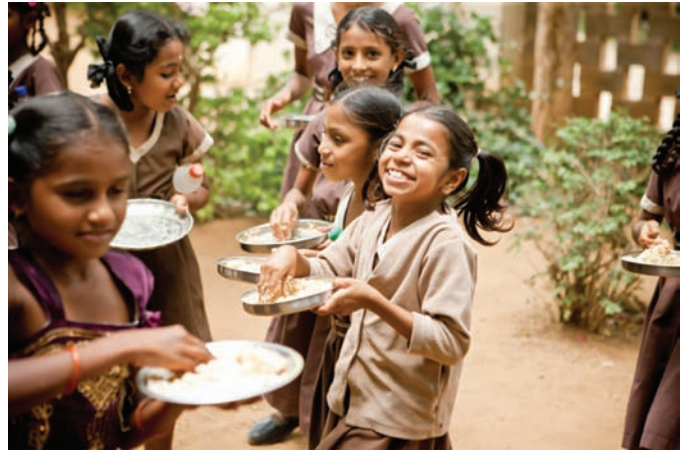
Students enjoy 12-cent lunches courtesy of Akshaya Patra.

to invest in intermediaries to accelerate the development of an entirely new field. It started out as a project run by non-profits and government agencies, and as early experiments proved successful, key innovators — backed by philanthropy — developed public data sources and third-party verification systems. Two innovations in particular — the first microfinance rating agency in 1999 and soon afterward, the launch of an authoritative data clearinghouse — gave mainstream investors easy access to the information they needed to make informed investment decisions. Over time, these intermediary organizations paved the way to attract for-profit capital markets into the microfinance arena.