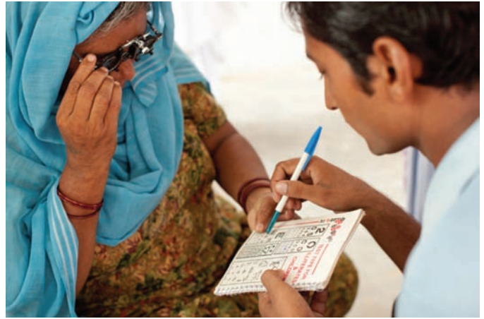
VisionSpring has developed a commercially-sustainable business model.

environment with tremendous need, BRAC improvised to hold costs down. It recruited women from the ranks of the poor and put them through a two-week crash teacher-training program; it also developed its own teaching materials. The cost to BRAC, supported by philanthropy and outside donors, is only $36 per student per year.